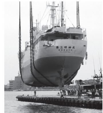
Lifted by crane