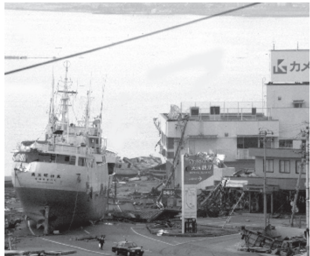
Myojin-Maru stranded ashore by tsunami

The mega-scale earthquake and tsunami in eastern Japan in March this year also attacked distant-water tuna longline fishing vessels. The sight of No.3 Myojin-Maru (379 gross tons) tacitly demonstrated the destructive power of the tsunami. Half a year after the disaster, the vessel was repaired and left