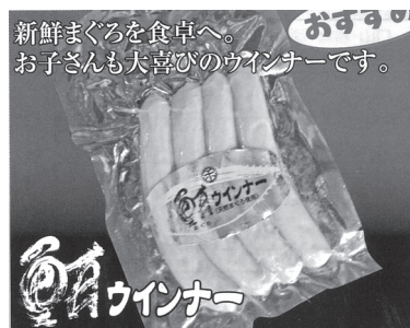
Tuna wiener sausage

The products attracted popularity as delicious food at a sampling session OPRT conducted for fisheries journalists. Most of the journalists attending the sampling highly valued the efforts of the company to use the under-utilized parts of tunas under the present circumstance where the regulations on tuna fisheries are getting rigorous and supply of tunas is on the decline.